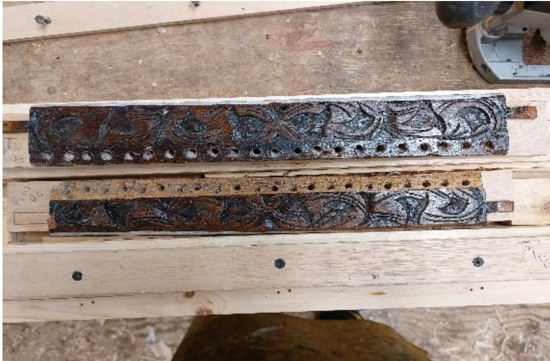
Fig 14, the routeing of the old edge. In Jig a (fig 6).

Robert Pye FIOC (Institute of Carpenters) BADA (West Dean) Diploma