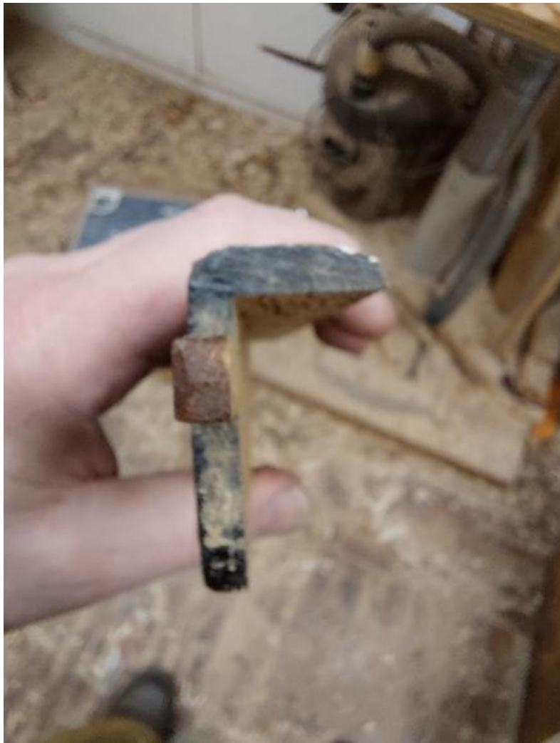
Fig 8, the remaining 'L' section of the seat frame.

Robert Pye FIOC (Institute of Carpenters) BADA (West Dean) Diploma