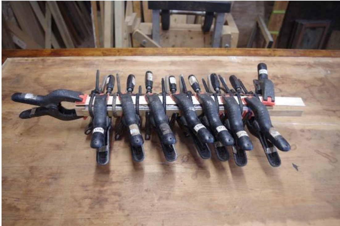
Fig 9, One of the seat rails with the replacement beech