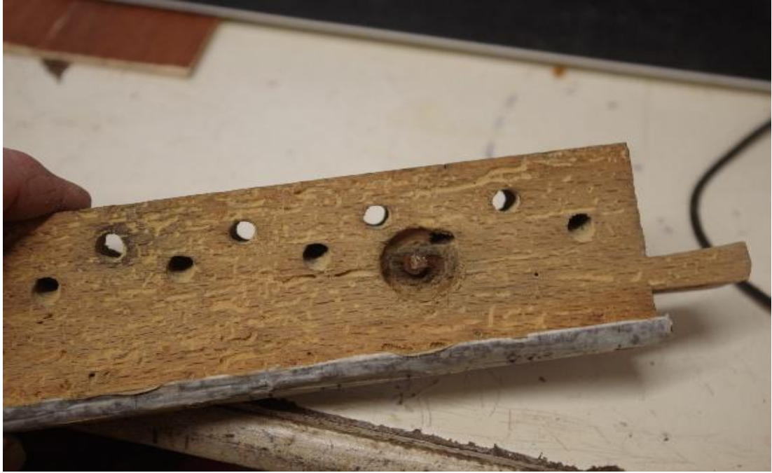
Fig 3, the remains of one of the, burried screws. More signs of worm.