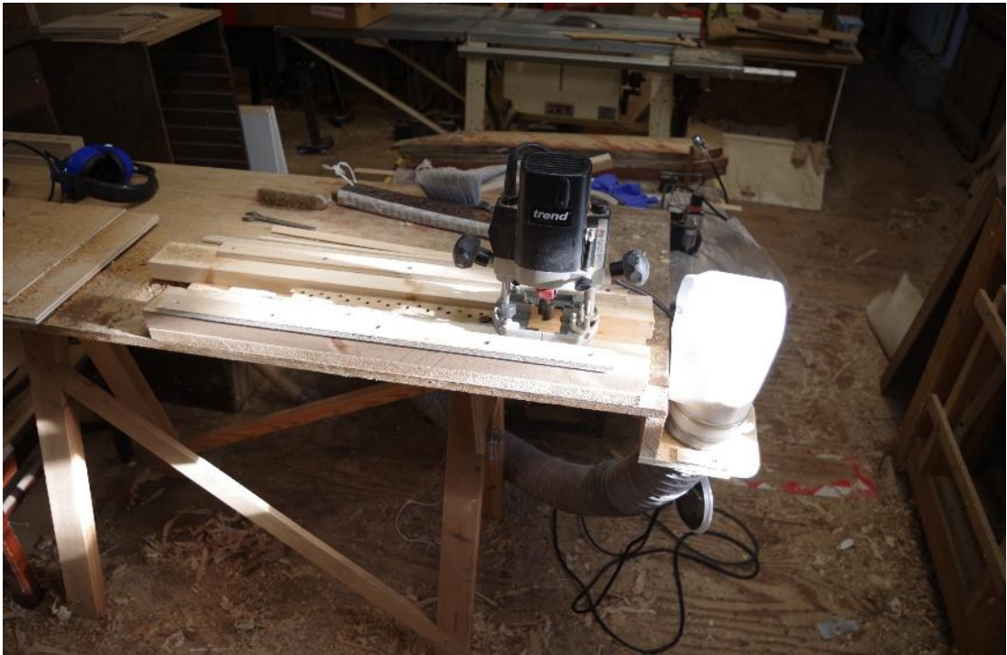
Fig 7, Jig A for routing (gutting the seat rails & the leading edges later).