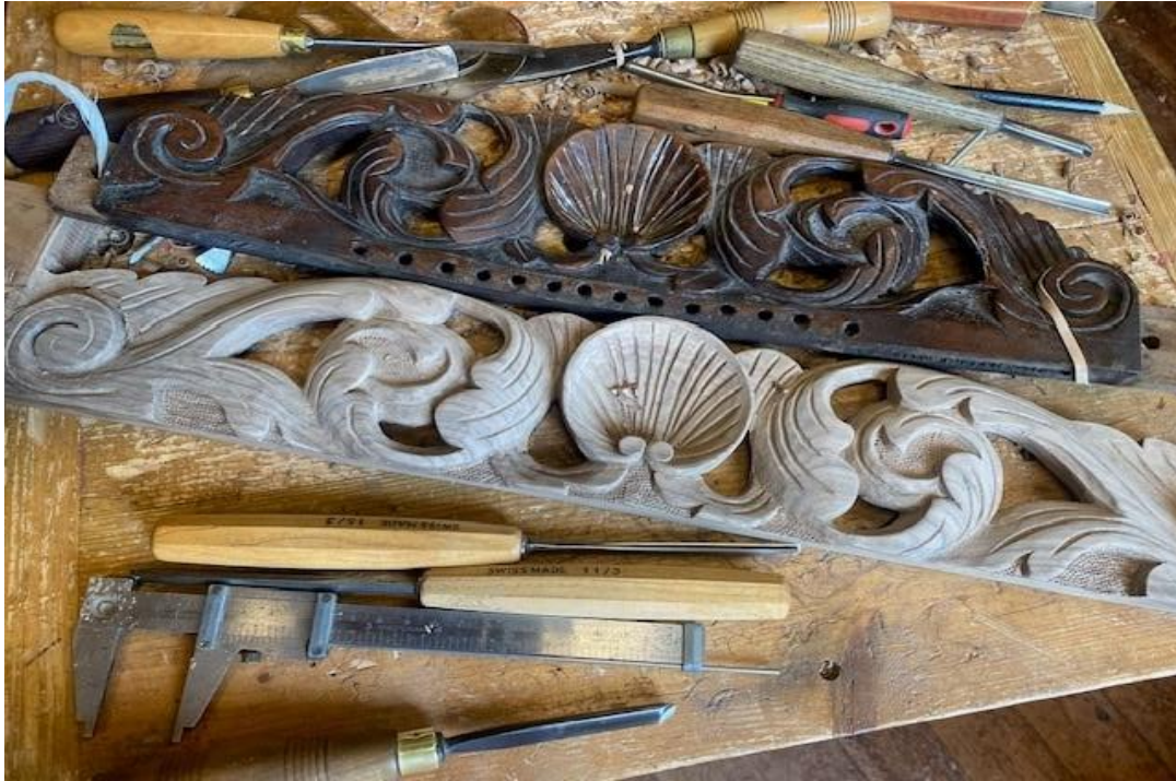
Fig 17, The new carved stretcher with the creating rail as a guide.