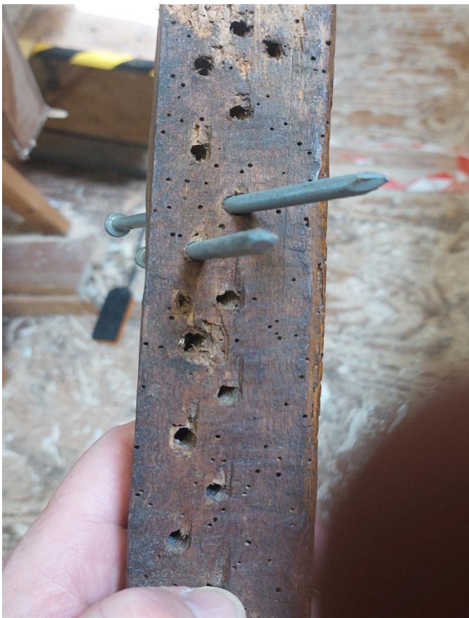
Fig 10, The offset holes on the seat frame.

Robert Pye FIOC (Institute of Carpenters) BADA (West Dean) Diploma