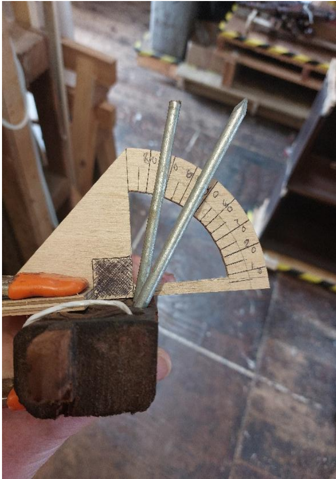
Fig 11, showing the 20degree difference.