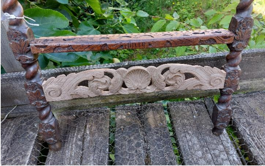
Fig 18, Stretcher in place.