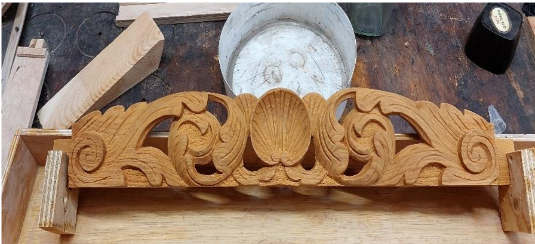
Fig 19, After bleaching with Nitric acid then neutralised with Acetic Acid and Oxalic acid.