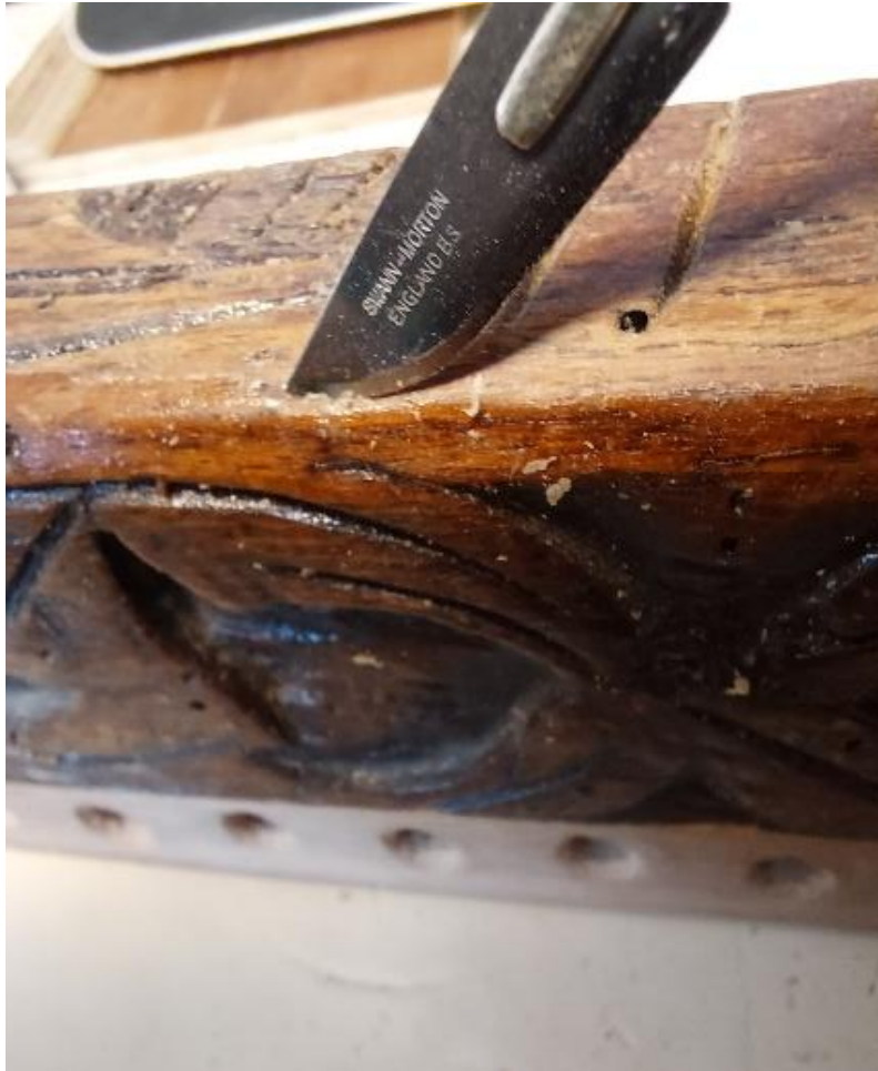
Fig 5, Scraping off the surface, the hardened consolidator off