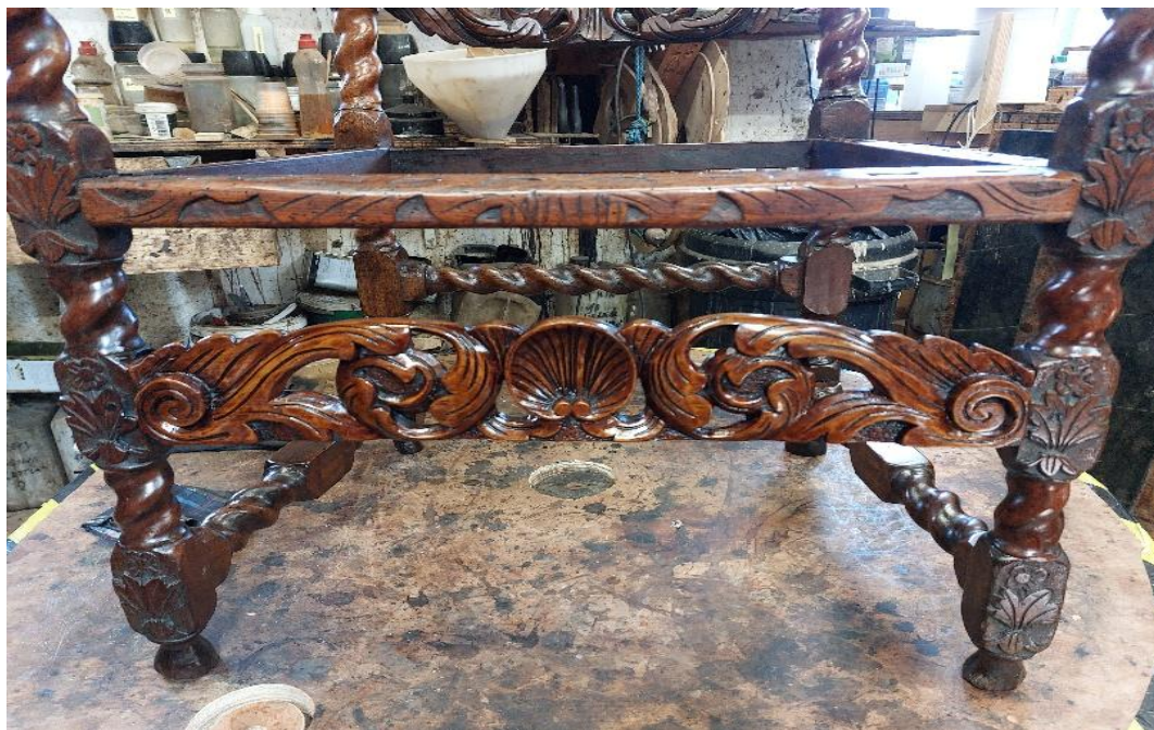
Fig 20, The Stretcher after colouring