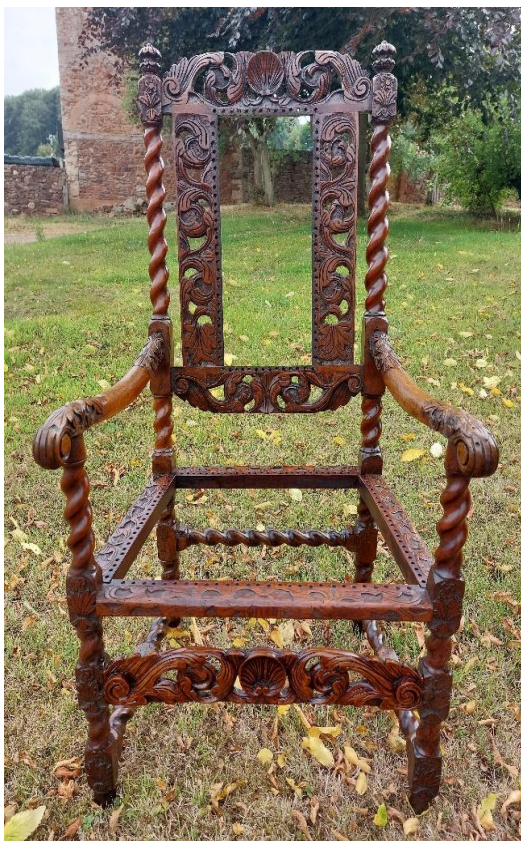
Fig 21 the chair before caning.