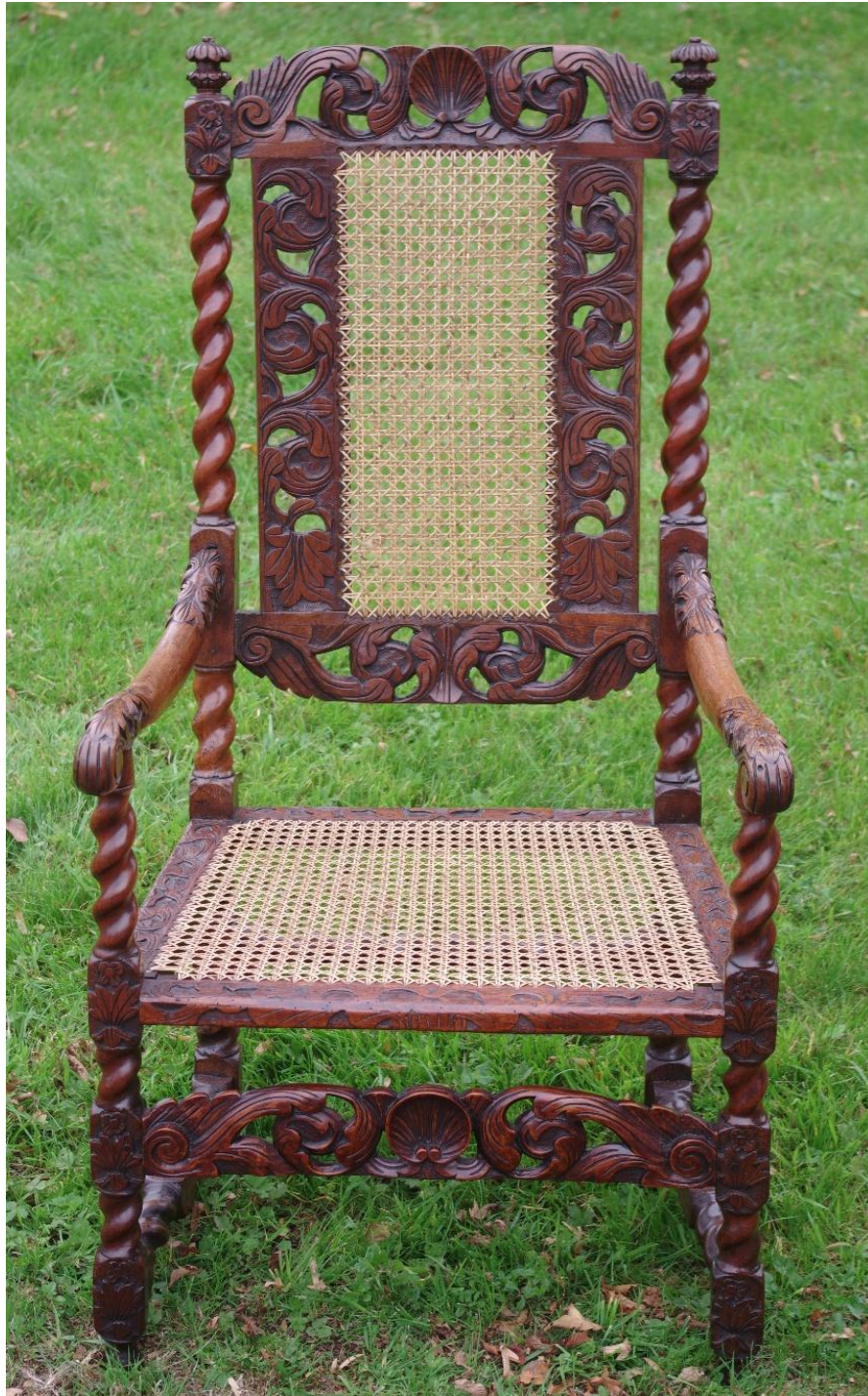
Fig 25, Finished chair with caning stained after losing the new look and hairy loose ends one the cane by flame.