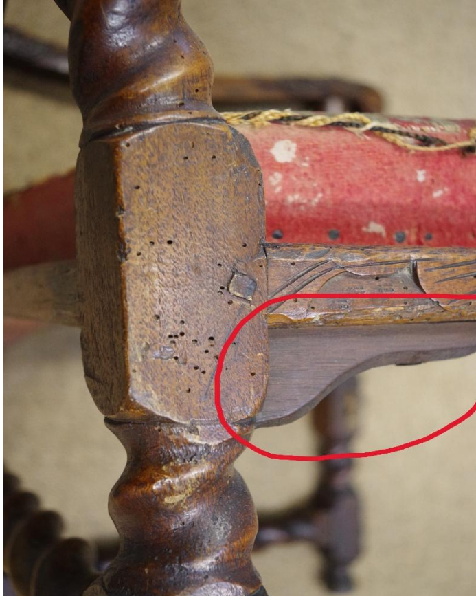
Fig 2, Corner block (back) you can see the woodworm is the back leg.

Robert Pye FIOC (Institute of Carpenters) BADA (West Dean) Diploma