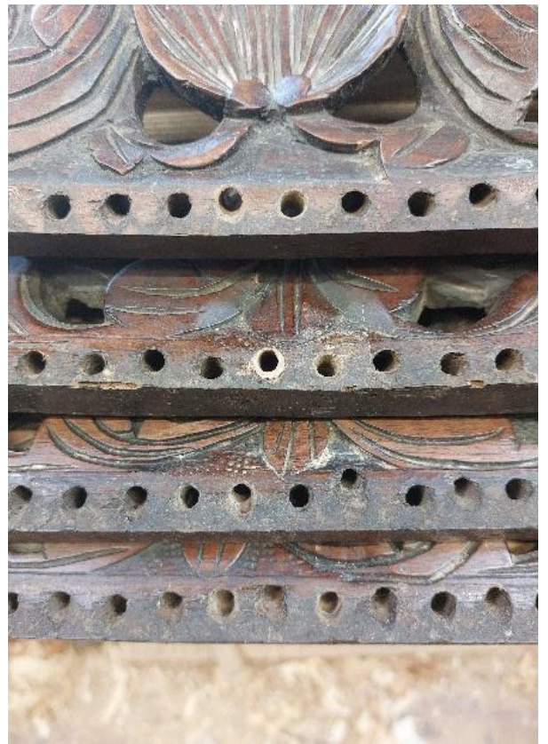
Fig 15 & 16, The plugged and drilled holes on the back carved , cresting rail and the bottom rail and the 2 sides of the back.

Robert Pye FIOC (Institute of Carpenters) BADA (West Dean) Diploma