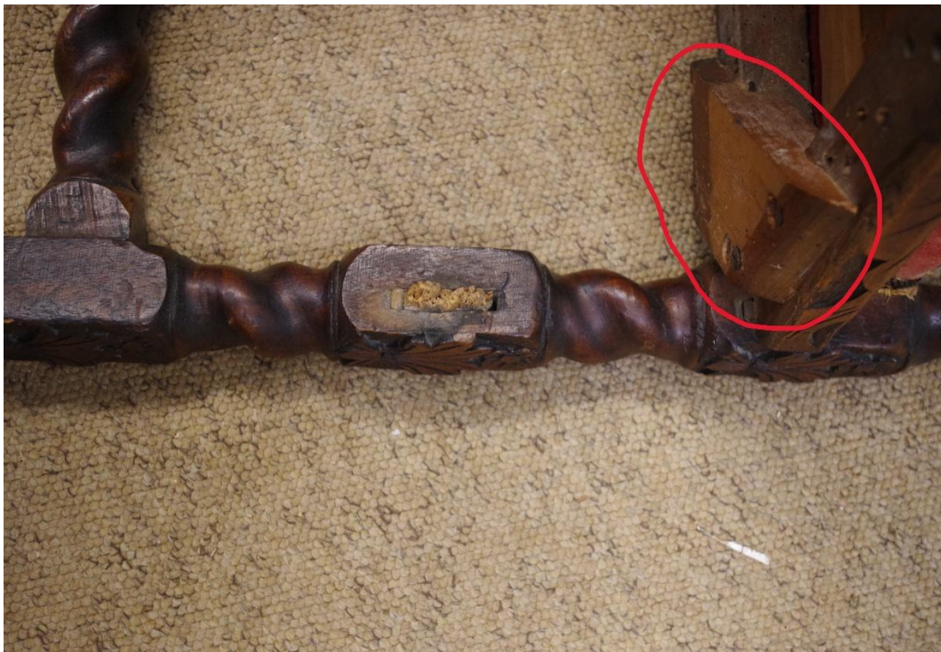
Fig,1 Front Blocks (pair).

Robert Pye FIOC (Institute of Carpenters) BADA (West Dean) Diploma