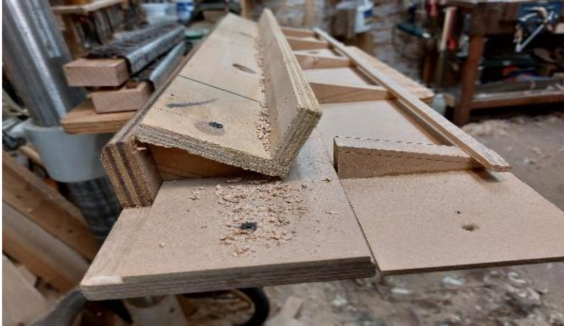
Fig 12, The Jig B & C for the drilling of the holes in the seat rails, & bask rails, Note the different angle with interchangeable angled boards.