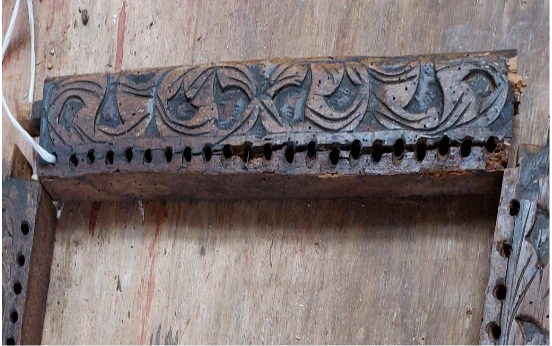
Fig 6, One of the seat rails with split down the line of cane holes due to the wood worm.